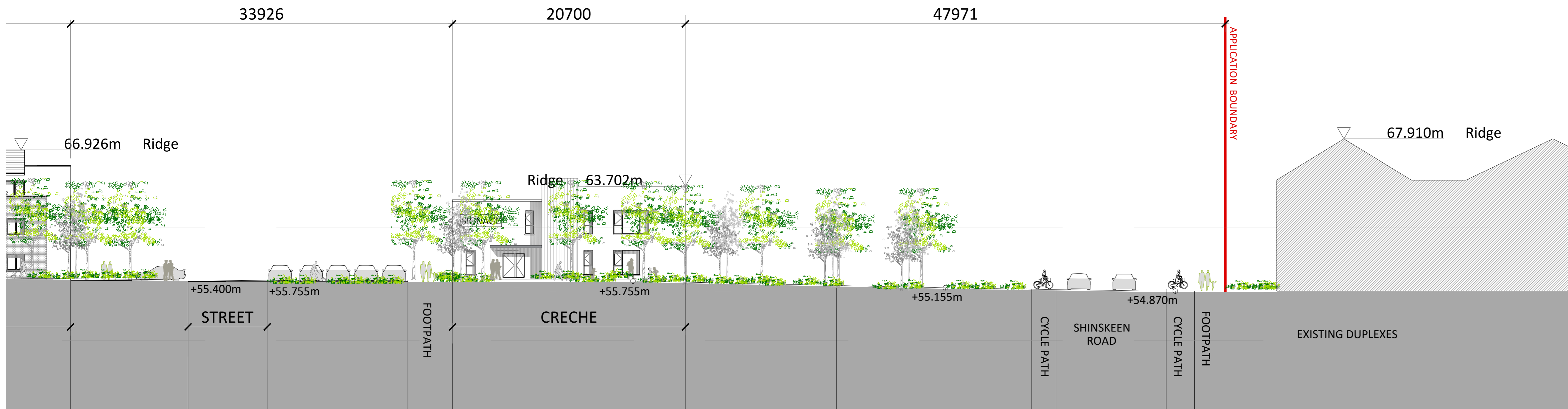
PART SECTION A-A: 1:200