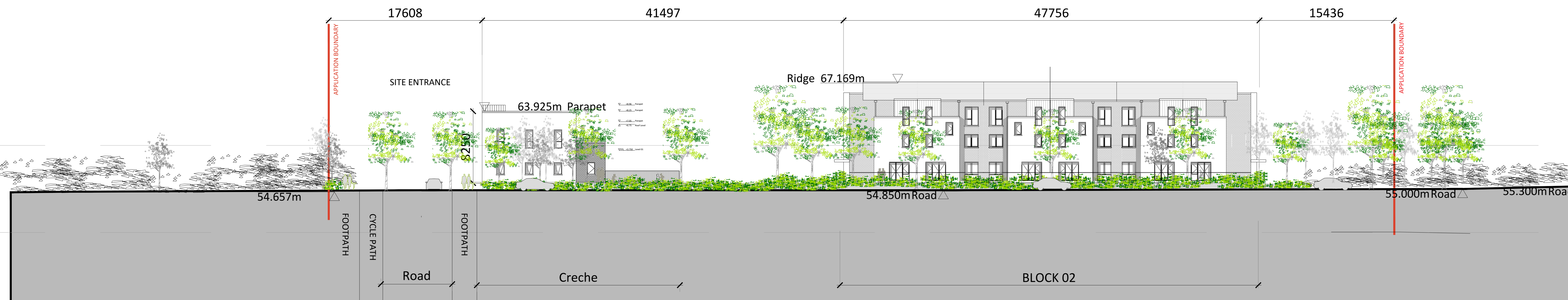
PROPOSED ELEVATION SHINSKEEN ROAD SECTION B-B: 1:200